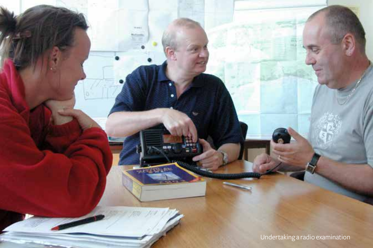
Undertaking a radio examination