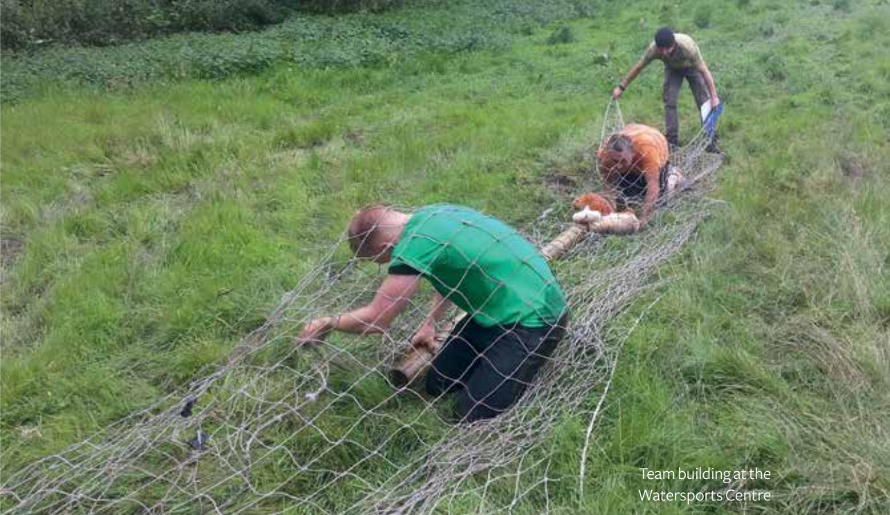
Team building at the Watersports Centre