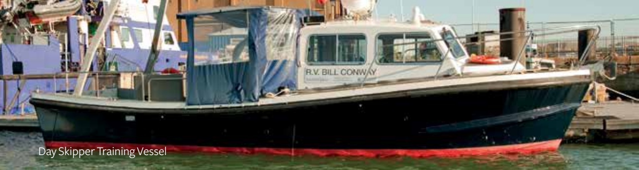
Day Skipper Training Vessel