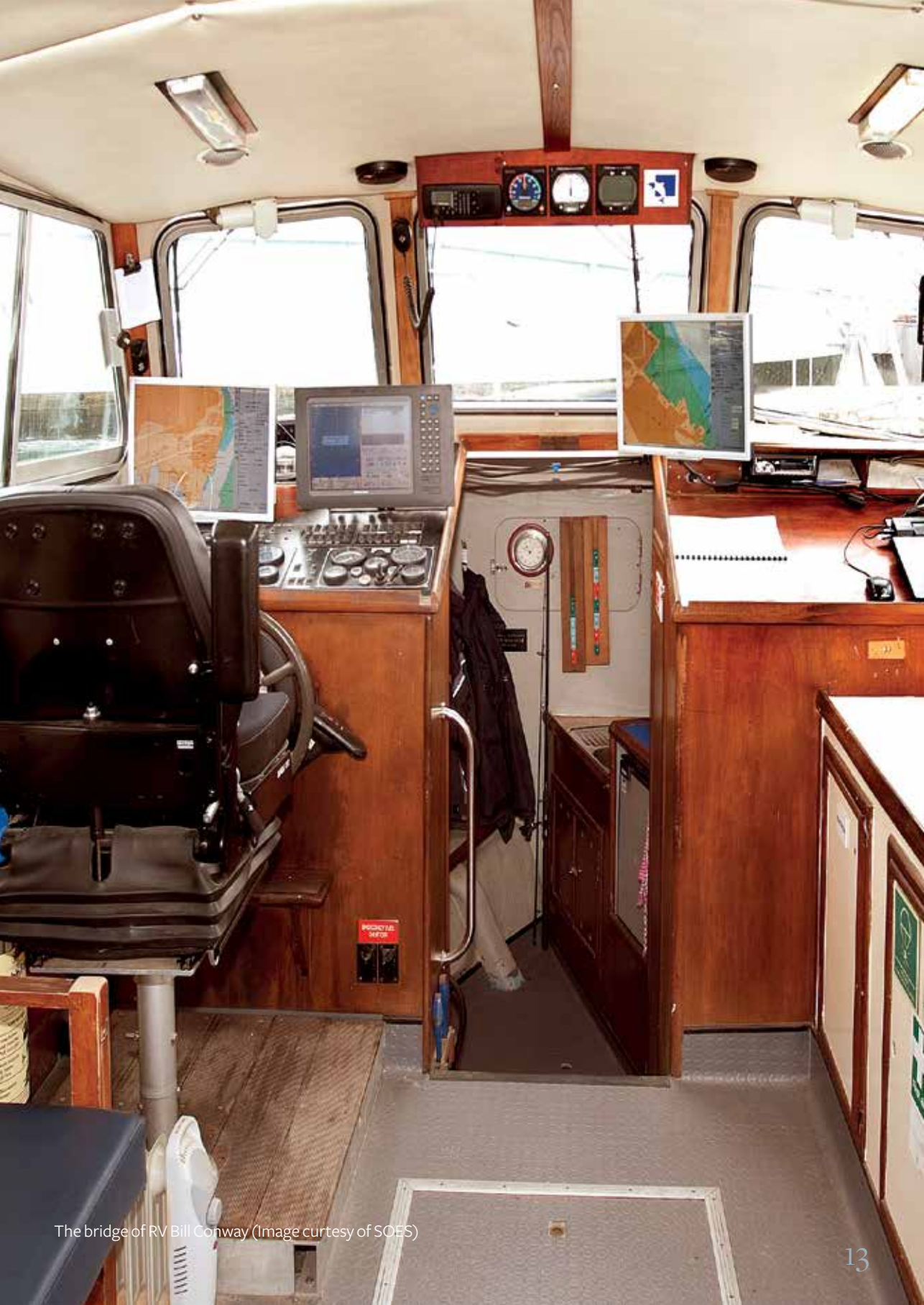
The bridge of RV Bill Conway