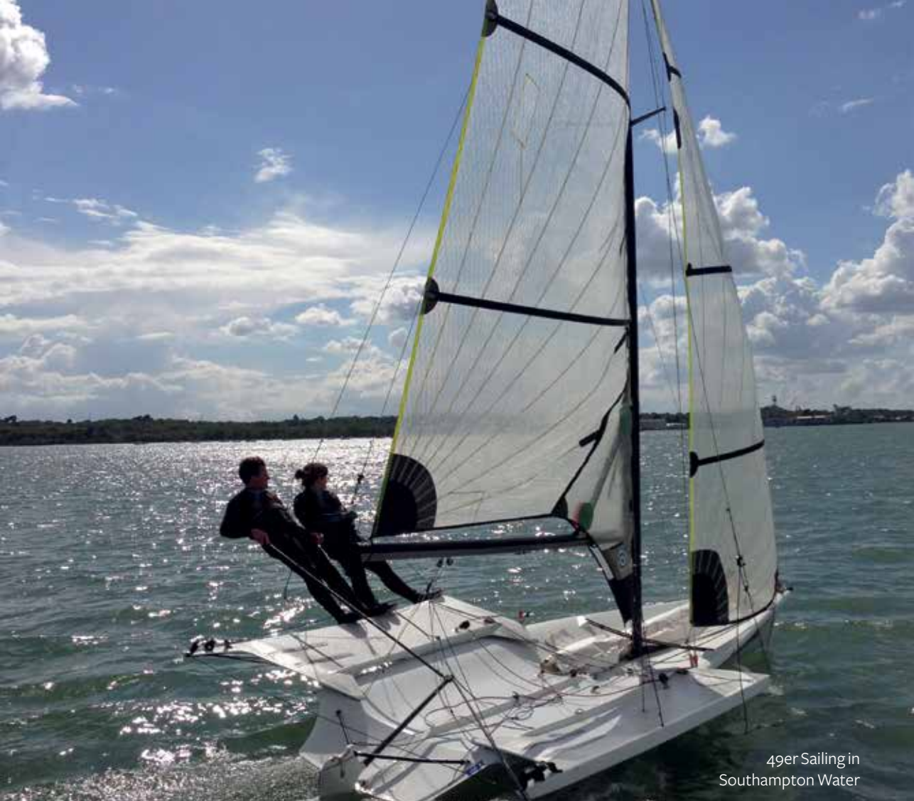
49er Sailing in Southampton Water