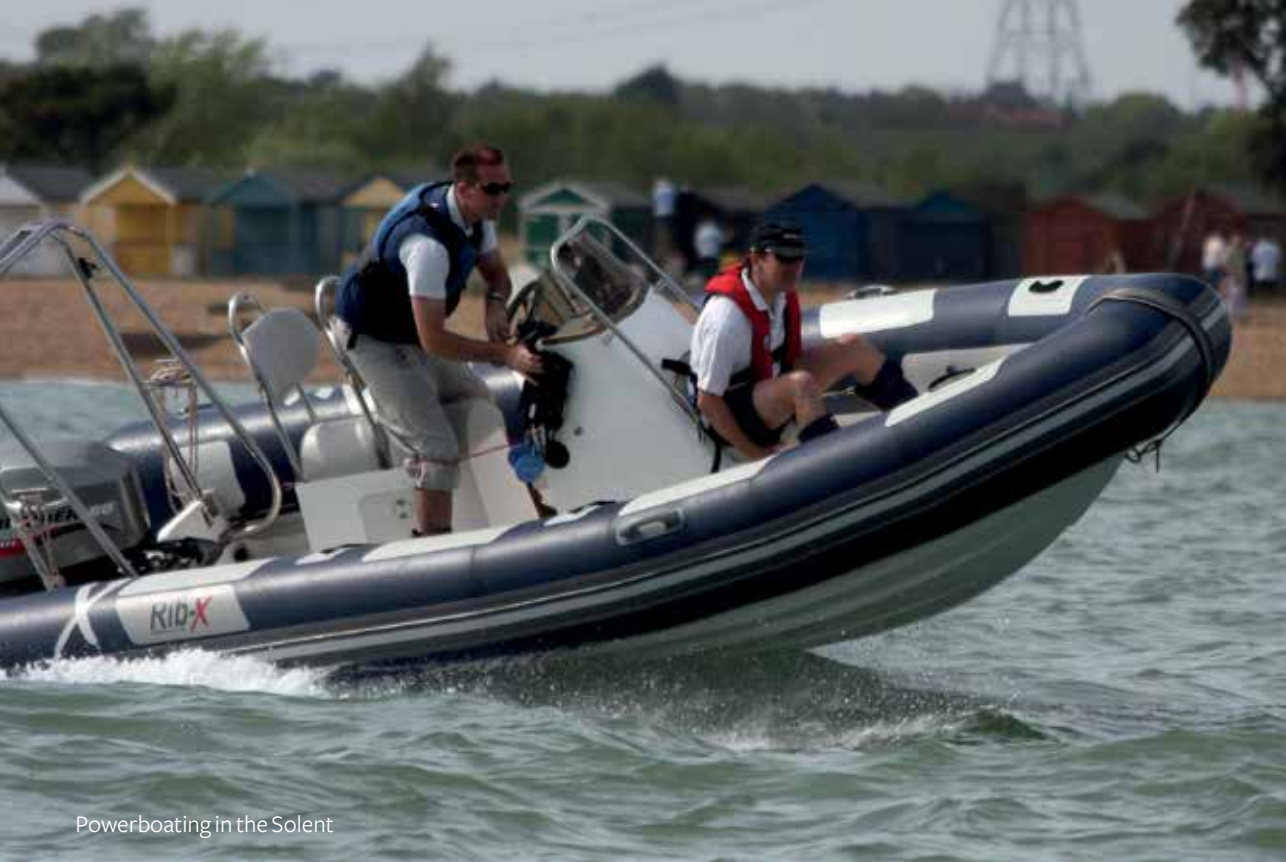
Powerboating in the Solent